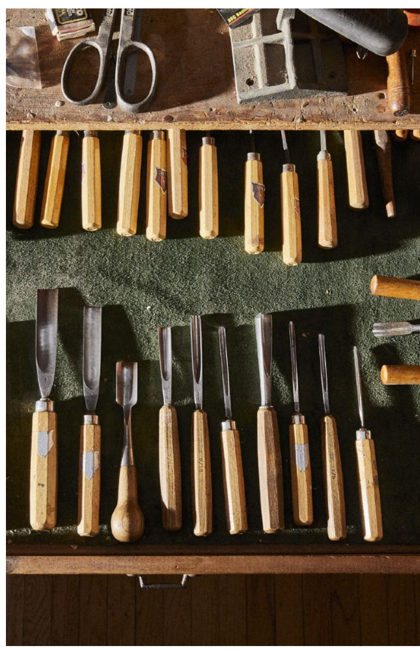
Racer uses English, Japanese, and Swiss tools in his work. The most special are the Swiss set that he purchased from an estate sale that belonged to one of the famed Swiss "Black Forest" carvers from